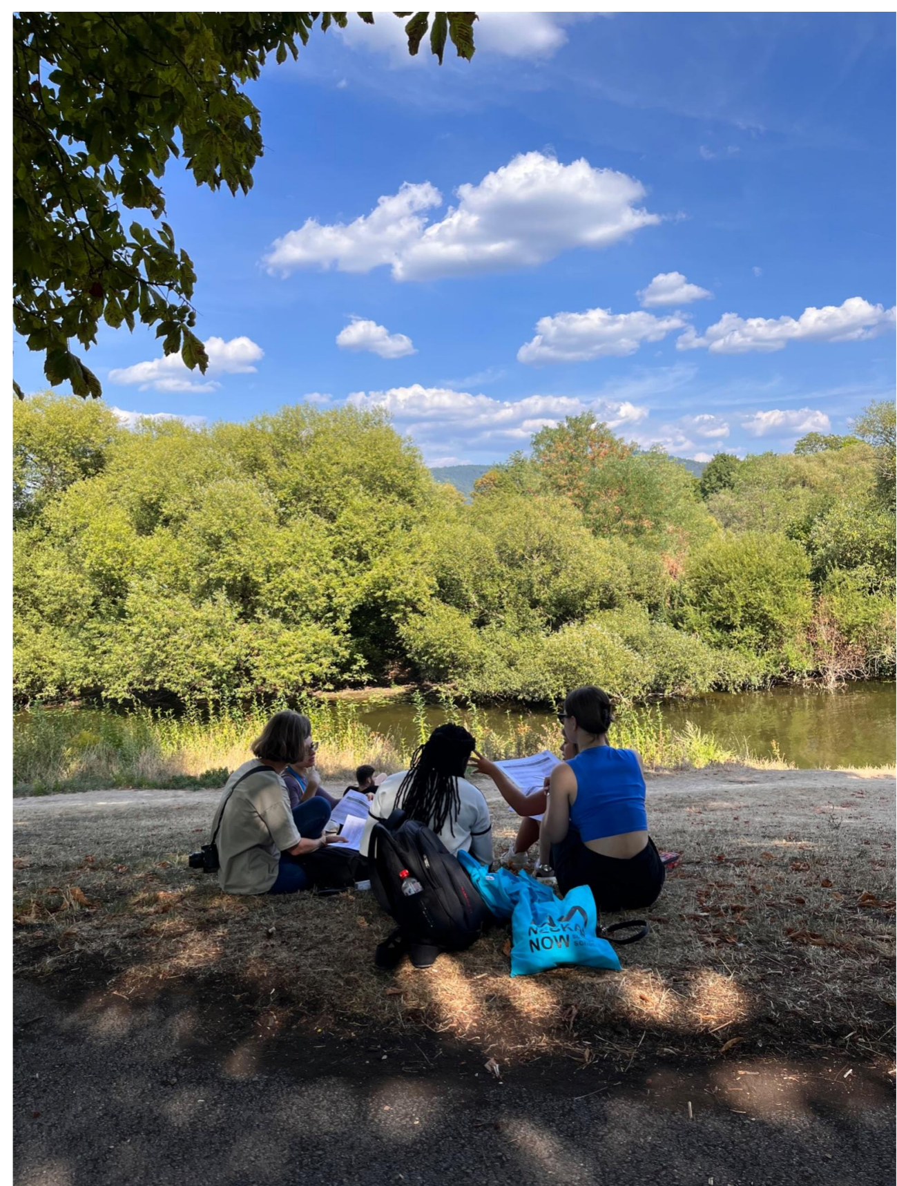
Learning outside of the classroom

We are an international group with participants and mentors from 13 countries (Albania, Brasil China, Germany, Ghana, Honduras, Indien, Iran, Peru, Portugal, Turkey, Russia, Spain)