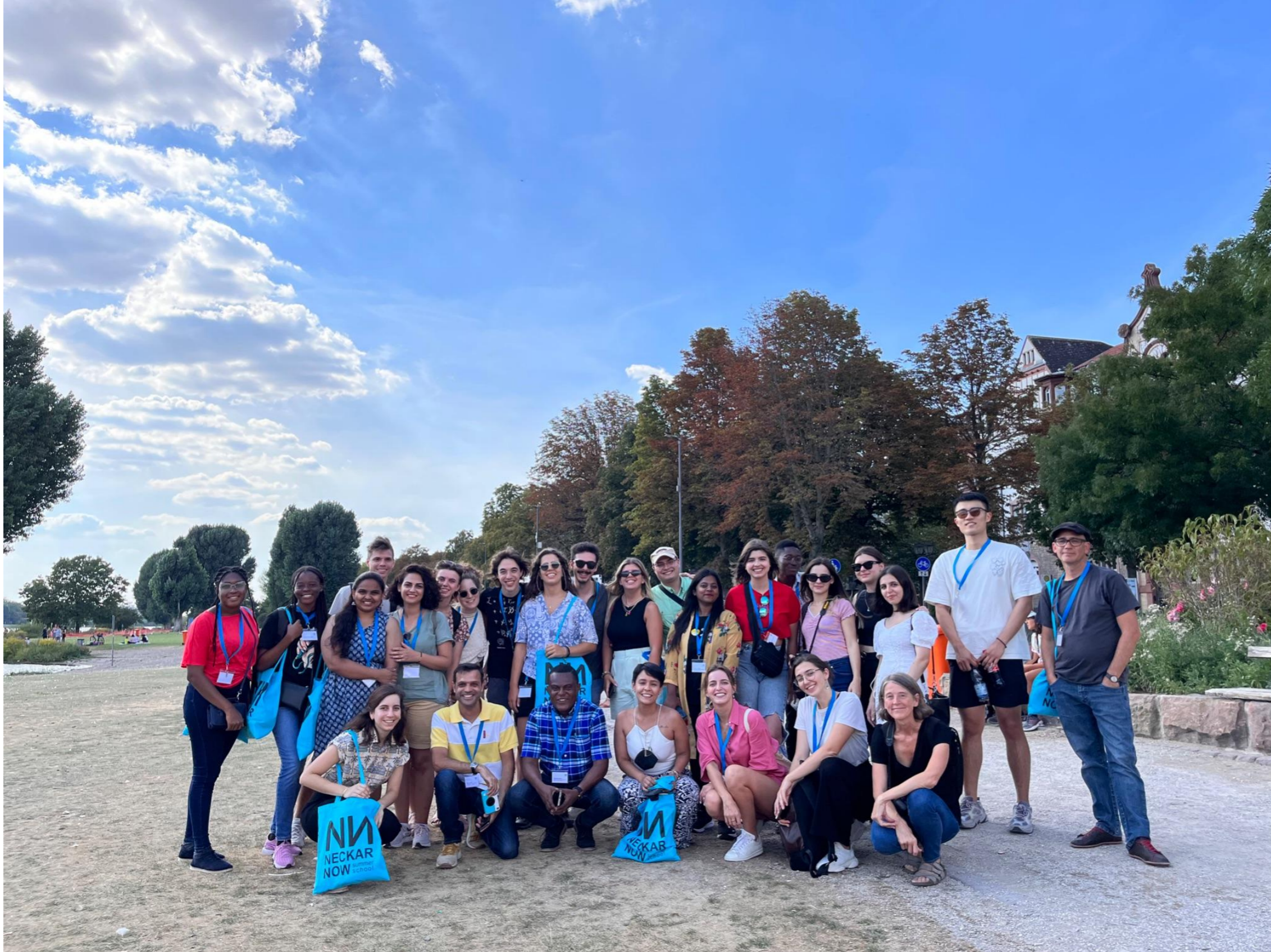
Field trips around the city.