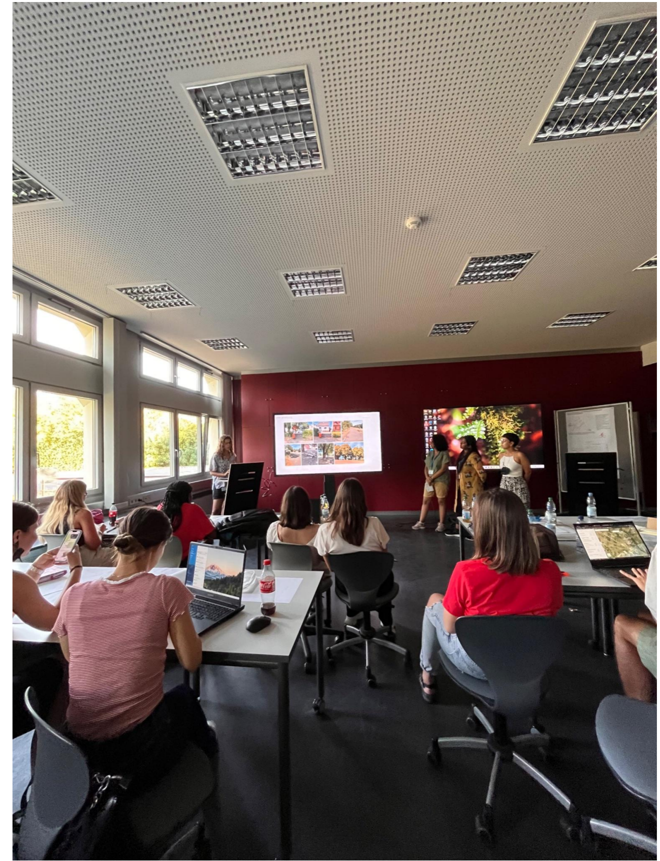
Presentations from the students

In this edition, the participants explored the technical and architectural challenges of a city on the river from the perspective of children.